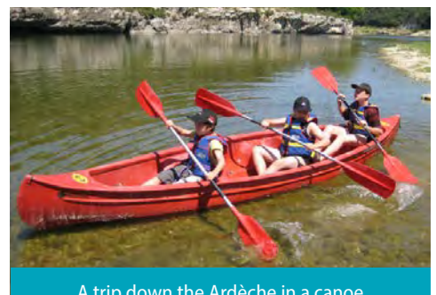
A trip down the Ardèche in a canoe